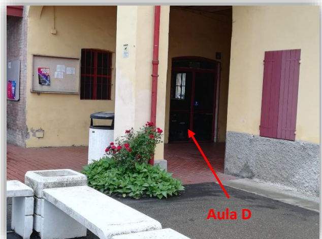
Figure 1. Aula D – Podere La Grande