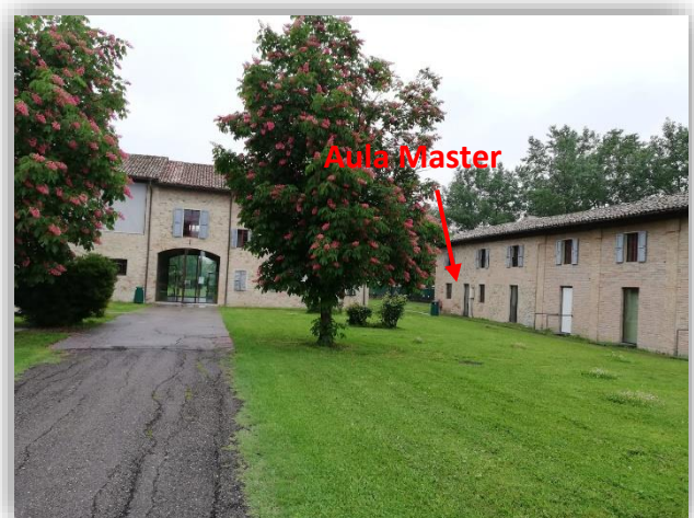
Figure 2. S. Elisabetta Conference Center